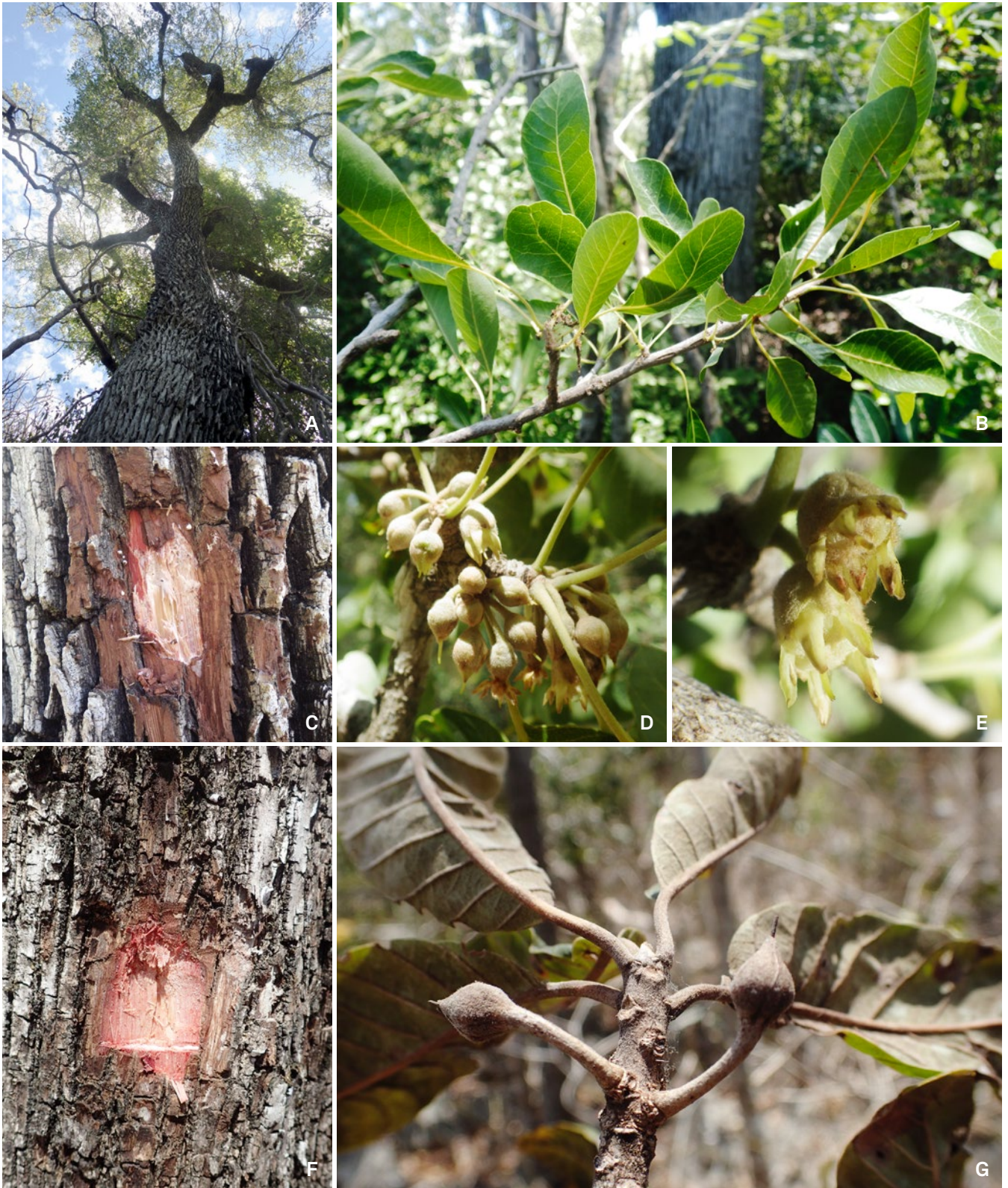
Fig. 2. – Capurodendron miquearum L. Gaut. & Boluda: A. Habit; B. Twig; C. Slashed bark; D. Fascicles of flowers; E. Flowers. Capurodendron namorokense L. Gaut. & Boluda: F. Slashed bark; G. Twig with two old flowers in an early fruit development stage. [A: Gautier 6329; B–E: Gautier 6339; F–G: Gautier et al. 6276]